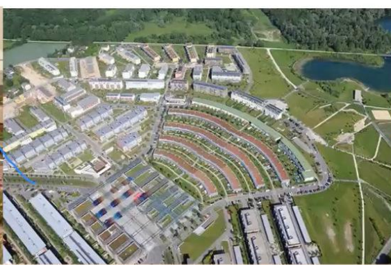
Solar City, by Atelier Dreiseitl, in Linz-Pichling, Austria