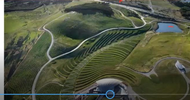
The Canberra National Arboretum by TCL, Canberra, Australia