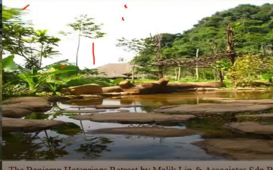
The Banjaran Hotsprings Retreat by Malik Lip & Associates Sdn Bhd, Perak, Malaysia