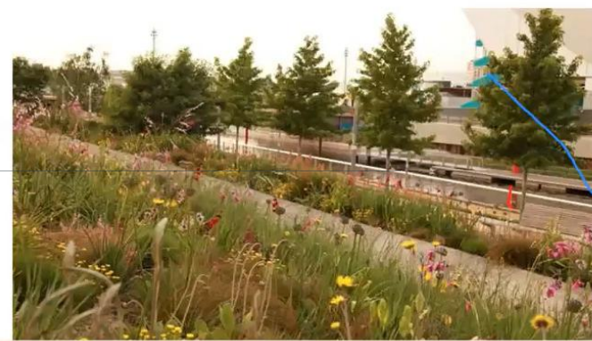
Queen Elizabeth Olympic Park by LDA Design et al., London, U.K.